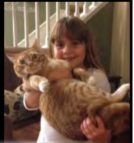
2014 alums Bean Dip ( seen above ) and his brother Nutmeg are deeply loved!