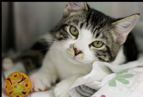
Sweet little Marvin, adopted in December 2013.