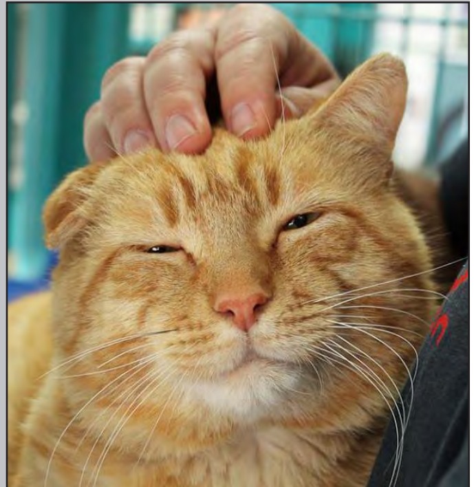
Handsome FIV+ Tom would not have survived at most shelters, but at ASAP he's a favorite among our volunteers!