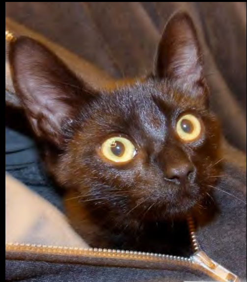
Scuba gets snugly in Dad's sweatshirt!