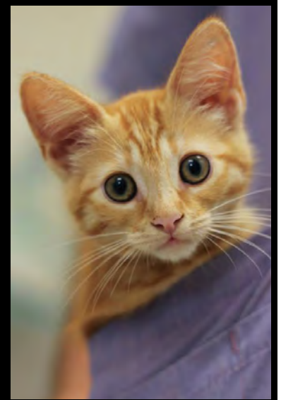
Pocket kittens are the best kind!