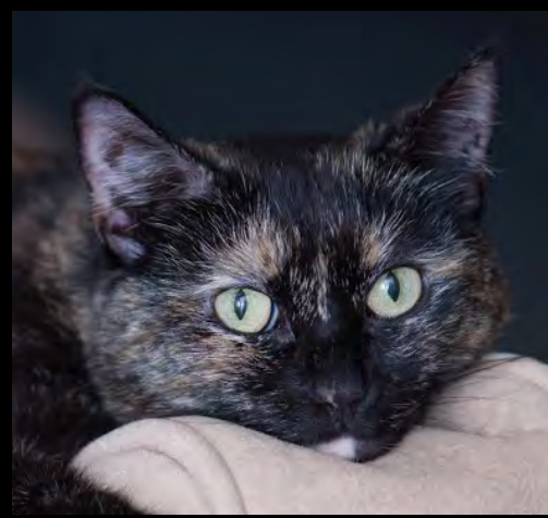
Abby, formerly Pie, adopted in 2012.