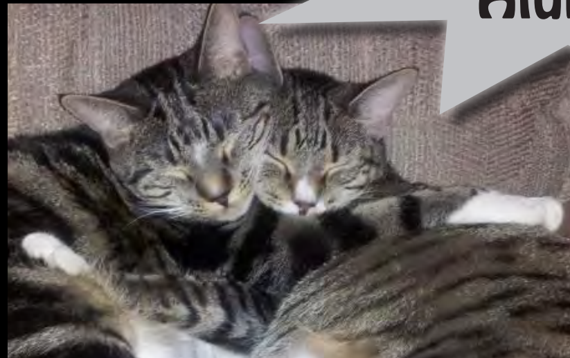
These cuties' humans drove all the way from Big Bear to adopt them!